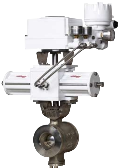
Valtek ShearStream SB