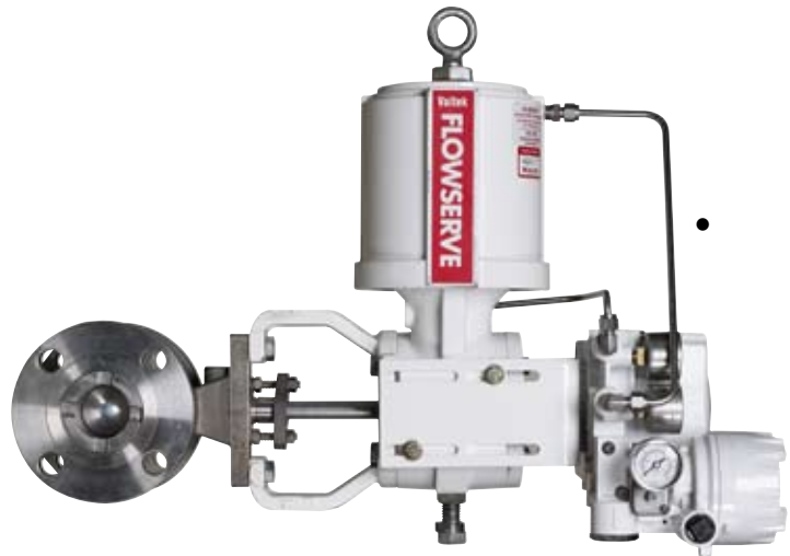
Valtek ShearStream HP

Effective control for demanding flows. After more than one hundred years of close cooperation with our customers, we at Flowserve know what it is all about. Our robust valve and actuators, together with our advanced positioners, are designed to cope with the demands and control of all types of flowing media. With the focus on performance. Flowserve's products are compact, modular-built, high performance packages that are optimized for exact control and cost-effective continuous operation. They have an extremely long life span as all parts are of highest quality. And they'll still be safe in the future as they use advanced technology and innovative solutions. Flowserve ensures a safe and cost-effective operation for our customers all over the world